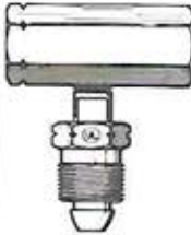
2001 MANIFOLD BLOCK TEE ASSEMBLY WITH CHECK VALVE For dual tank installations standard POL connections